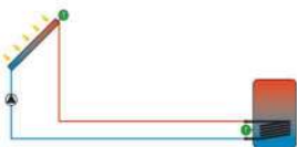
Internal heat exchanger, intelligent pump control